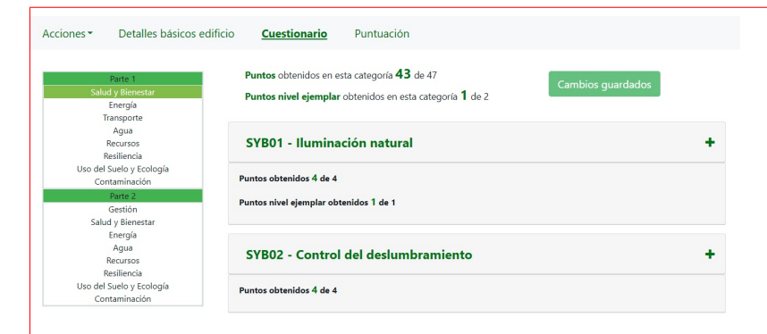
Figure 1: View of the questionnaire.